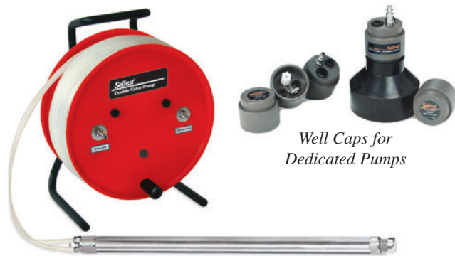
Portable Pump on Hand Reel

For less frequent sampling, reel mounted portable systems allow access to multiple monitoring wells, even in remote locations. The reel mounted portable units are free-standing with a convenient carrying handle. They can be made for almost any size or depth of application.