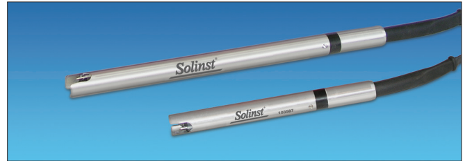
Model 122 P1 and 122M Probes